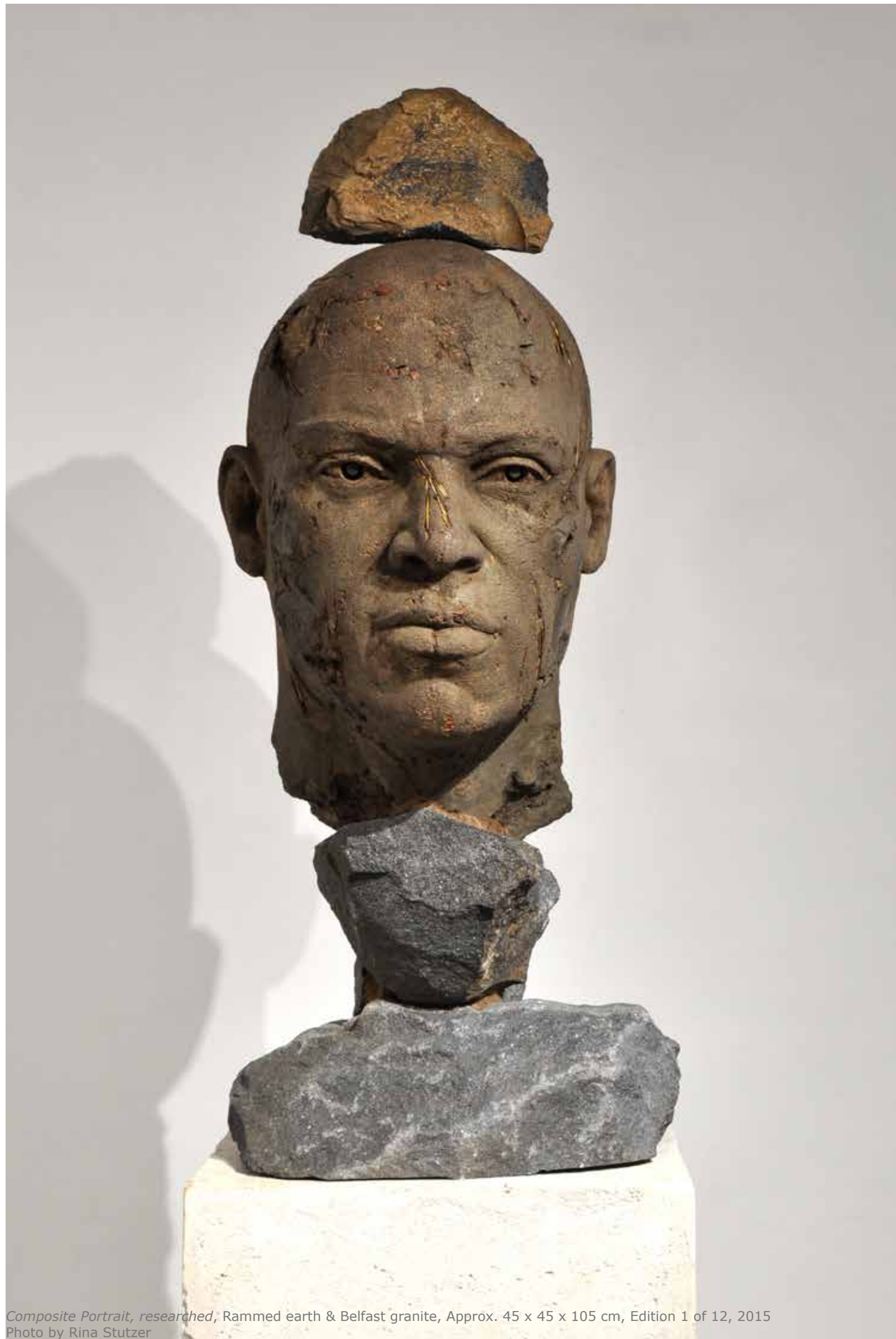
Composite Portrait, researched , Rammed earth & Belfast granite, Approx. 45 x 45 x 105 cm, Edition 1 of 12, 2015