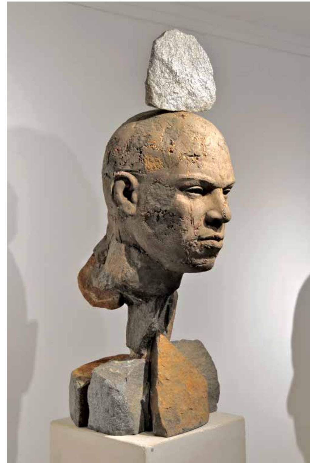
Composite Portrait, researched Edition 2 of 12

AT: In short it once again comes back to the market and the gift economy, the fight against the commodification of everything we do and the largest value that you can sell for. I make large