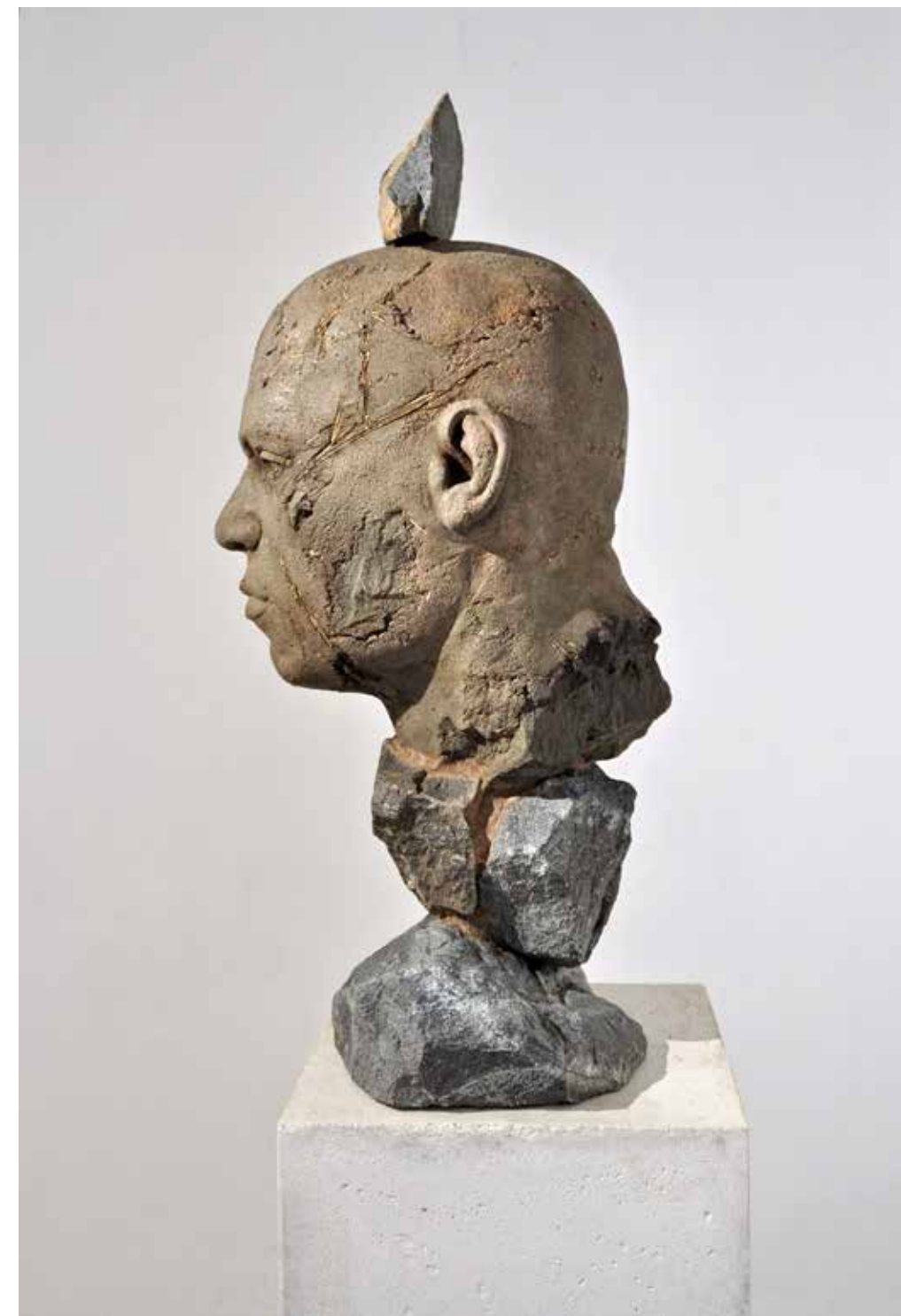
Composite Portrait, researched (side view) Edition 1 of 12

As artists, none of us went to study art to become rich, and you're a bit silly if you do that. I always loved art