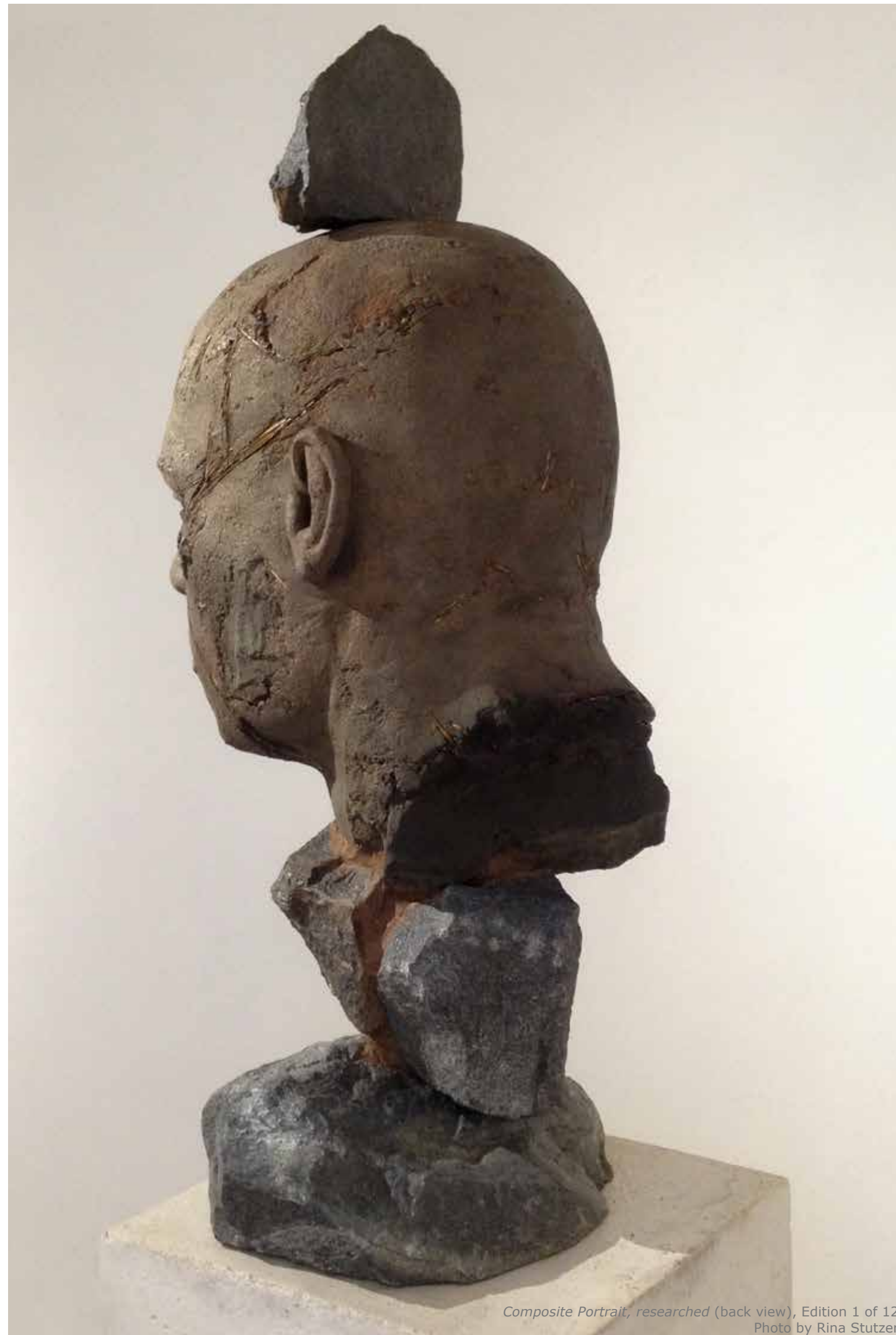
Composite Portrait, researched (back view) , Edition 1 of 12