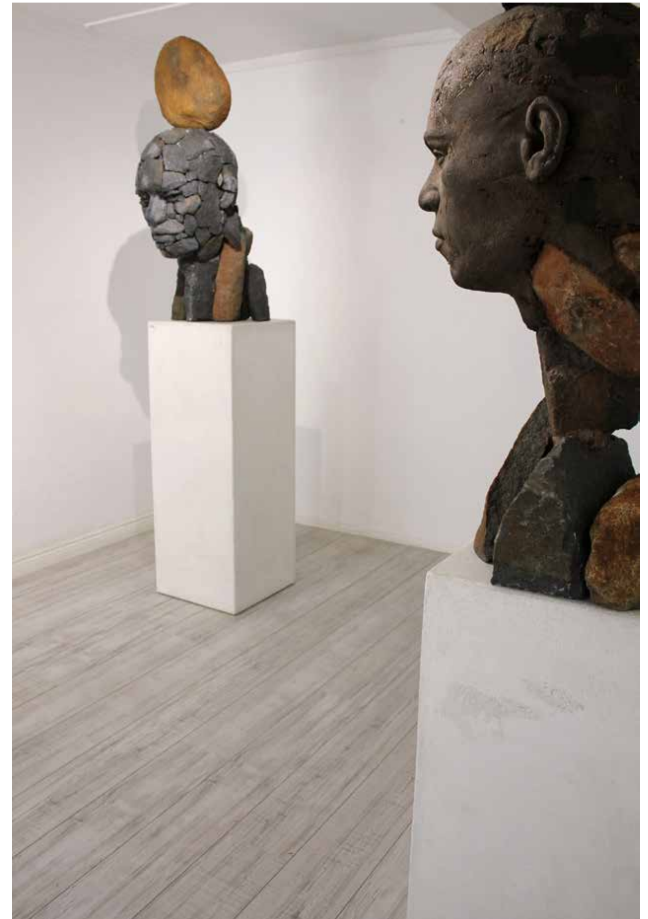
Installation view

The sculptures exhibited here are mixed media rammed earth portraits, and they are part of a series of 12. What that means is that there are 12 in that series. They are all unique.