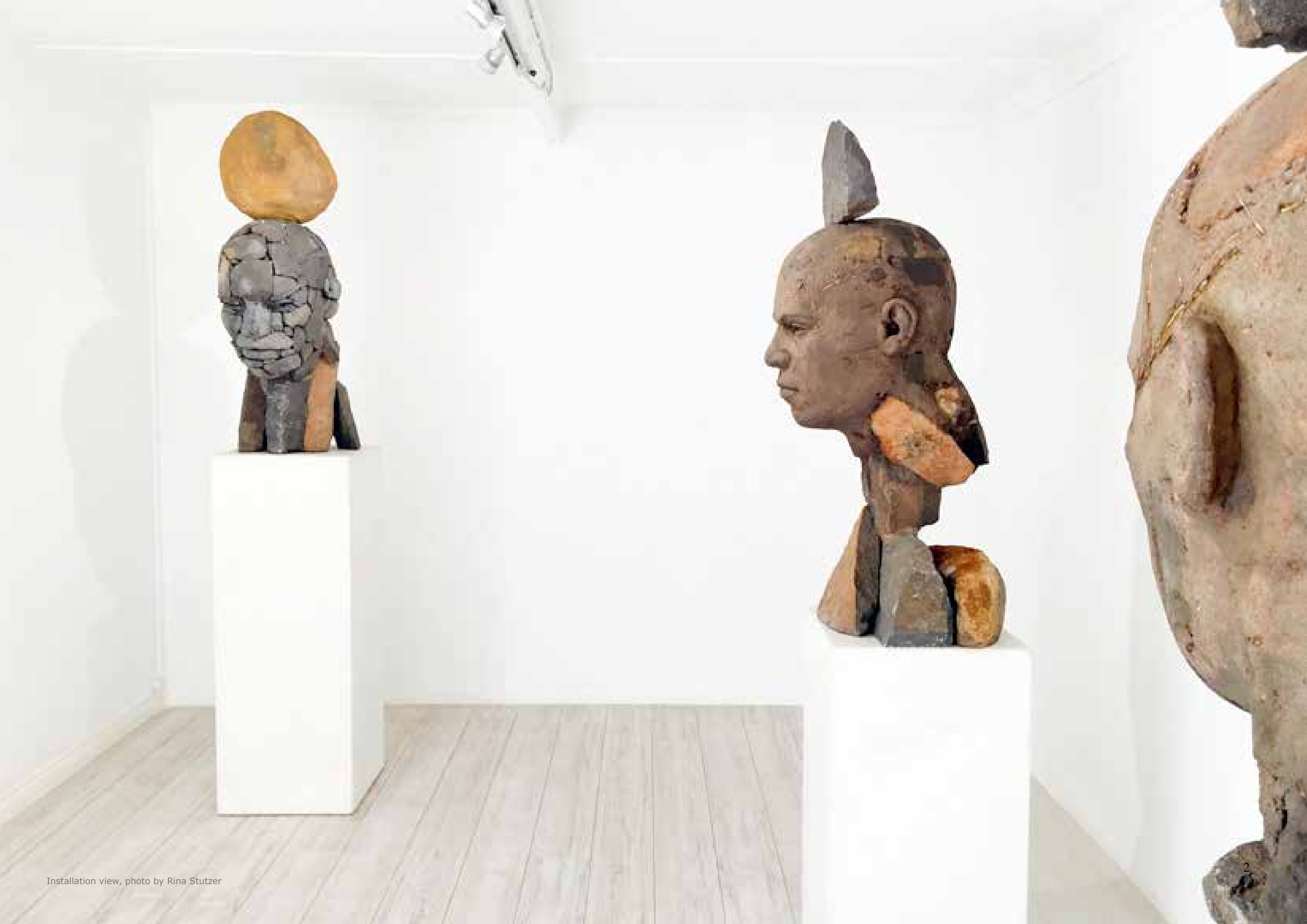
Installation view