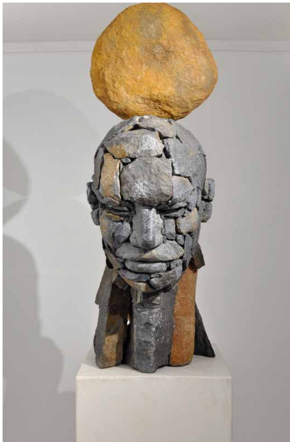
Composite Portrait, researched I Belfast granite, stainless steel and solidified with concrete Approx. 45 x 45 x 110 cm Edition 1 of 12 2015

JT: I wonder if we could just quickly look at some of the works and think about the working processes involved in creating the massive portraits. We are looking at two different portraits, the one is made from stone and the other from rammed earth. At the risk of sounding almost too technical, would you quickly explain to people what you mean when you say 'rammed earth' and then explain how you made the stone one.