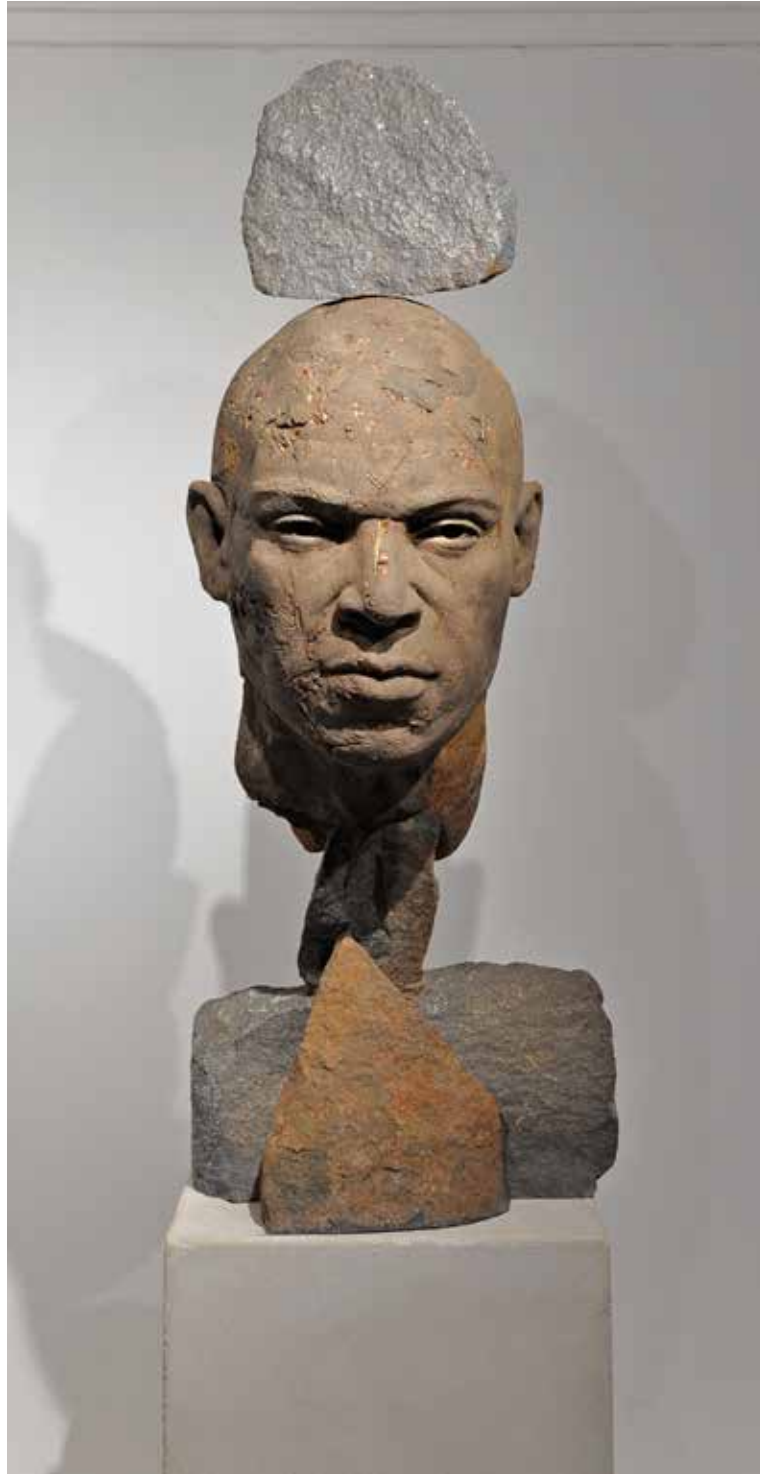
Composite Portrait, researched Rammed earth & Belfast granite Approx. 45 x 45 x 120 cm Edition 2 of 12 2015