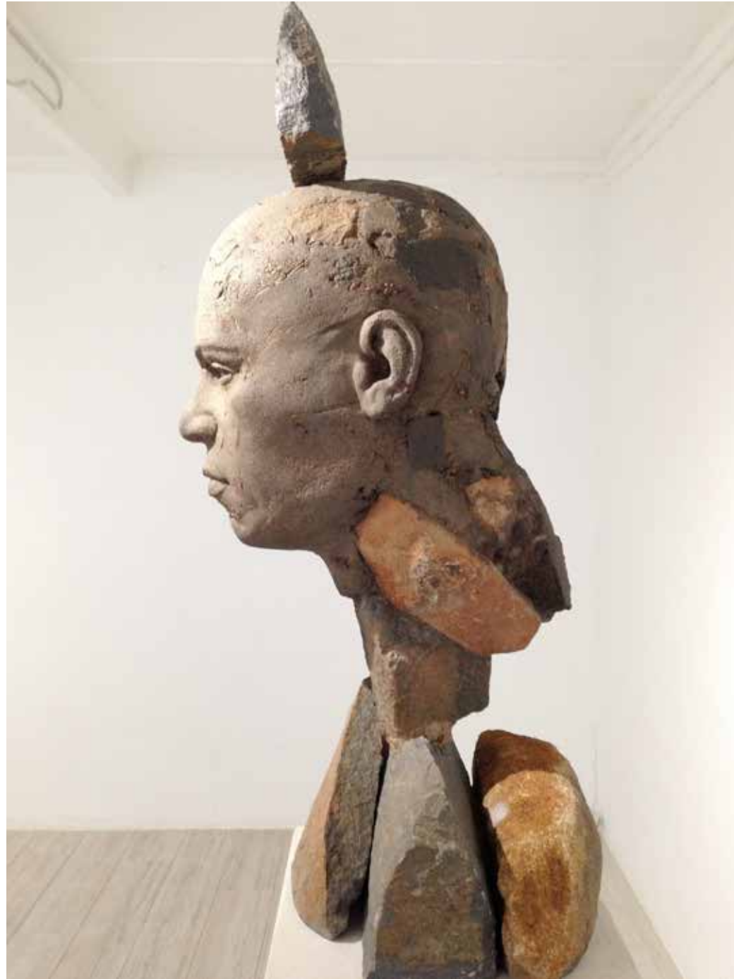
Composite Portrait, researched (side view) Edition 1 of 12

takes so long. And there is always the risk that if you did it, and you made an 'object', it could be frowned upon. It's a political game, so we must just please get over that idea and understand there is something beautiful and poetic about the communication from the artist to the viewer. This can't happen if you outsource, and the artist should know that. There is something really good in mastering the language, and we must keep on practicing.