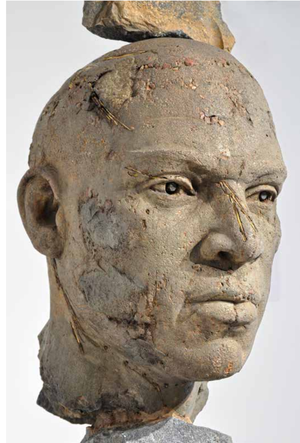
Composite Portrait, researched (detail) Edition 1 of 12 Photo by Rina Stutzer

photography for the odd 100 years or so, but we as sculptors did not have such a resource at our disposal. So we could never go into the landscape, take a photograph and paint it in your studio, but now we can with 3D. It still needs artist hands and energy in it before it becomes something. Perhaps that energy could also happen via digital media, if you sat at your computer and you spent the time and energy into it, it could also be. But I believe that it is human interaction that makes it and gives it life.