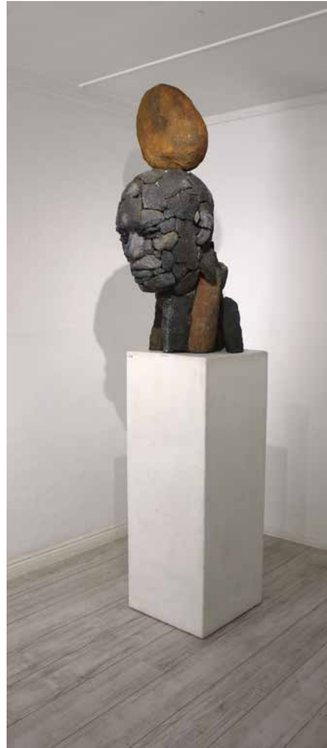
Composite Portrait, researched

sculptures, which is a problem to some collectors (we built one in Belgium out of 25 tons of stone, and the guy said "now what if we want to sell it" and I was so happy to say, "You can't sell it"). It's not a commodity anymore, we built it and it's going to stay there. If you want to move it, you're going to destroy it. So that is part of it: to make something and once it's made, it's out of the market, and it ceases to be a commodity. Because the process is laborious, but not as intense as bronze or stone, we can actually gift it. So you go can to a town or university and make one, like we did at Stellenbosch University and the University of Johannesburg. If people look after it, it will remain for hundreds of years, but it has the same vulnerability or fragility as humankind. You can take it from its being in one day. If you take a hammer or a rock and you hit it, you can remove its nose, or an ear. Or a couple of wrong characters in Stellenbosch can break the legs off (and that has happened before). But in a way it's also expected that the ignoramus are people who don't understand culture, and would therefore do something like that to the medium. We could say 'naughty, you shouldn't do that,' and maybe they'll learn something from it. It's a process of engaging with the public that wouldn't necessarily go to a museum or a gallery.